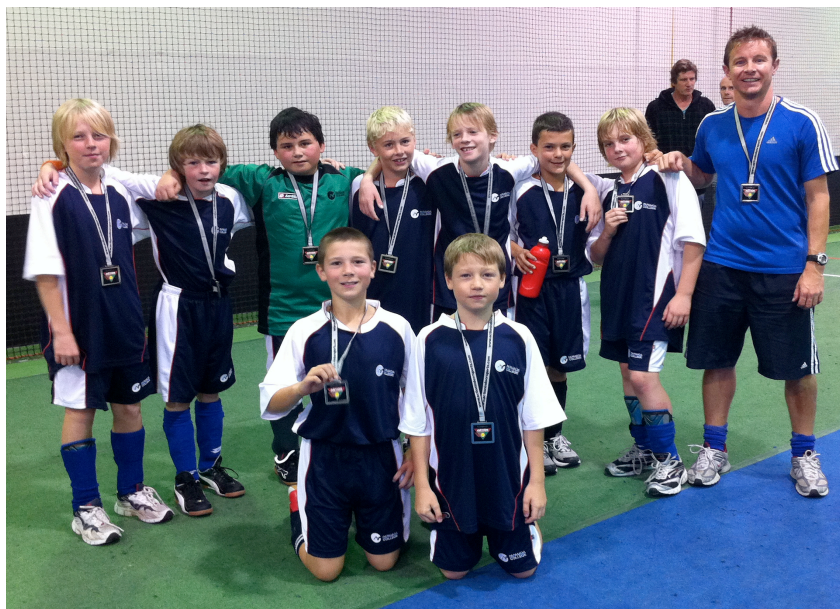
Year 7 Boys Indoor Football Team

Papamoa College had 4 football teams represented at the Bay of Plenty Indoor Football competition on 7 June. Congratulations to all teams for the following results: Y9 Boys - 2nd place, Year 7 Boys - 2nd place, Year 7 Girls - 3rd place, and Year 8 Boys - 3rd place.