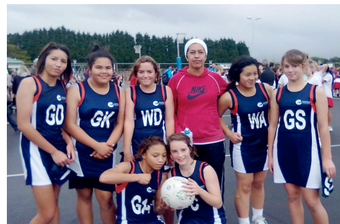
Year 8A Netball Team wearing the new uniform