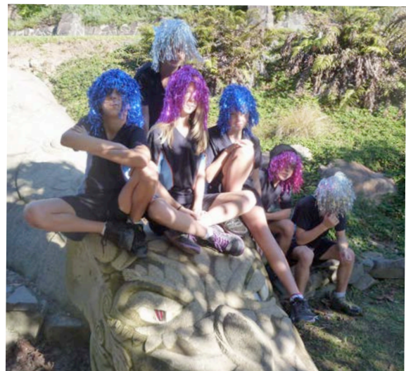
The 2013 Amazing Race Team