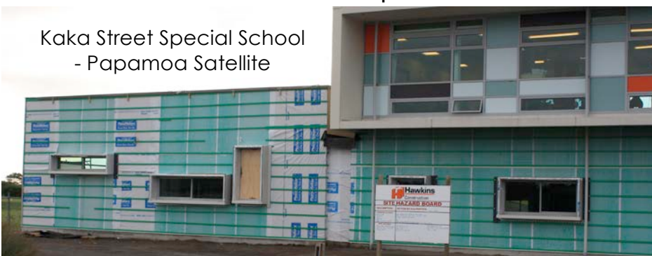
Kaka Street Special School - Papamoa Satellite

Y11 students stay home on study leave from 16 to 20 September and are only required to attend school for their scheduled exams. It is important to ensure students use this time to study and prepare well, as these results may be used as evidence of achievement if they are medically unable to sit their exams at the end of the year.