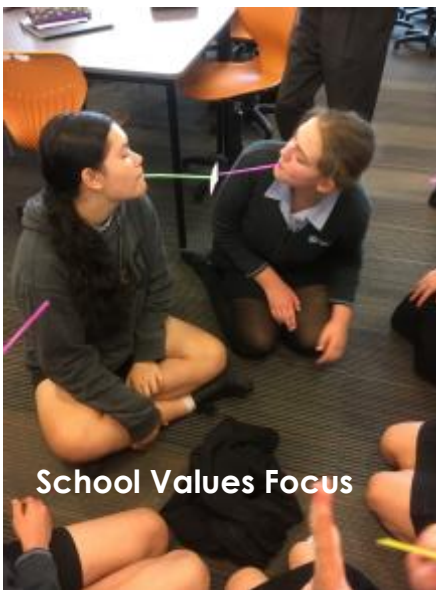
School Values Focus