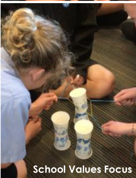
School Values Focus