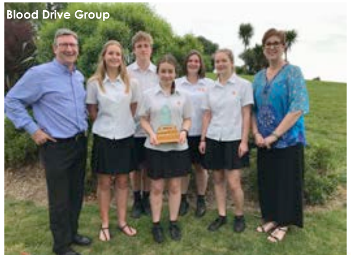
Blood Drive Group

A fantastic effort from all involved – well done!