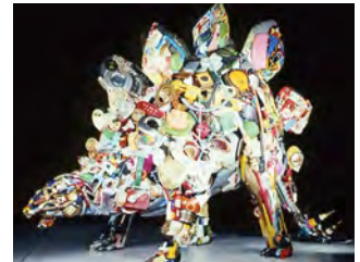
Example of a still-life project

These would be used for still-life projects. What might be junk to you now, could be the makings of a masterpiece! Donations can be dropped into the College Reception.